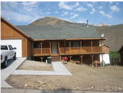
Sierra Nevada Home